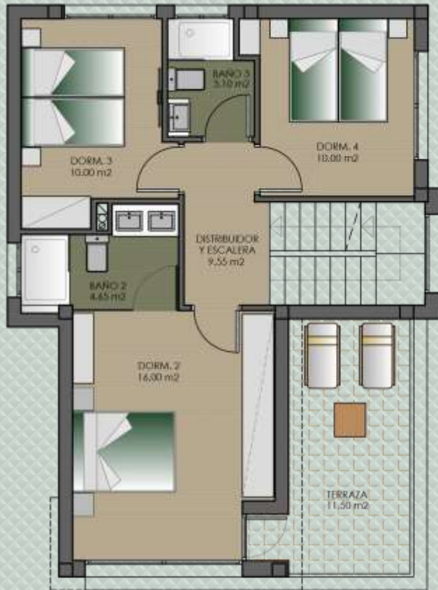
FIRST FLOOR / PLANTA PRIMERA